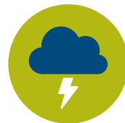
STRIFE WITHIN TEAM