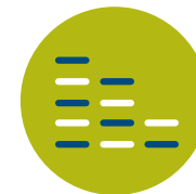
IMPACT ON PRODUCTIVITY AND REPUTATION